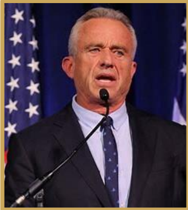
Robert F. Kennedy Jr. HHS Secretary

12 primary agency leaders, including CMS, FDA, CDC, NIH, etc