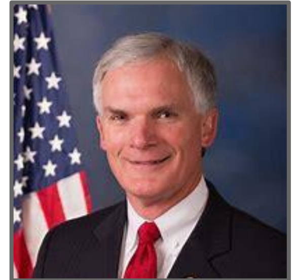
Rep. Bob Latta (R-OH) House Energy and Commerce Committee Chair*

Senator Bill Cassidy, HELP Chair, is also on Finance