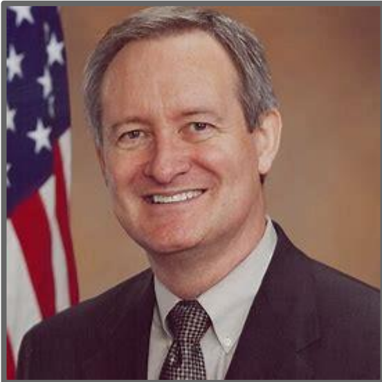
Senator Mike Crapo (R-ID) Senate Finance Committee Chair

Leadership of Congressional Committees with Jurisdiction over Medicare Advantage