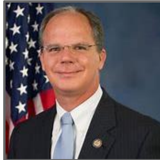
Rep. Brett Guthrie (R-KY) House Energy and Commerce Committee Chair*