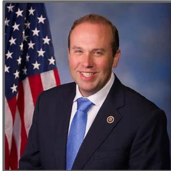
Rep. Jason Smith (R-MO) House Ways and Means Committee Chair