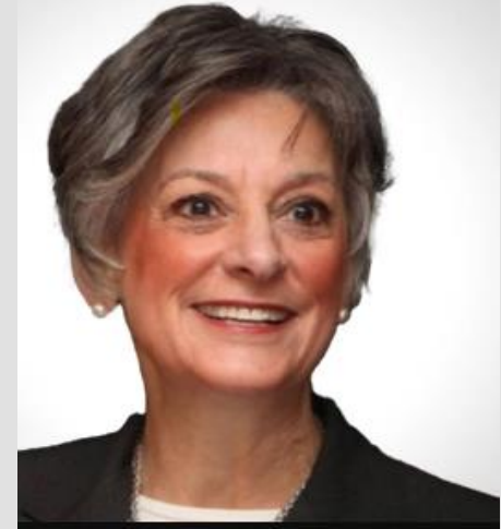
Allyson Schwartz Senior Advisor